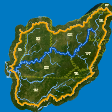
Ohio River Basin